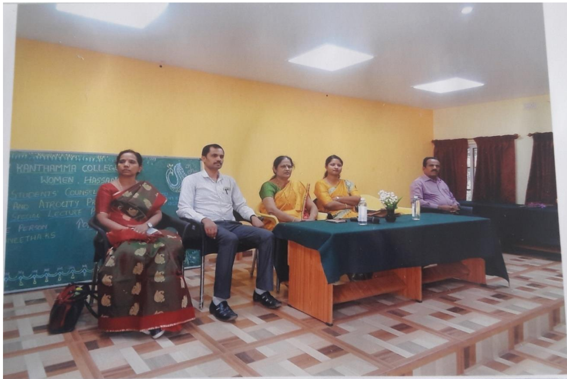
Special Lecture programme on “Mental Health and Stress Management”