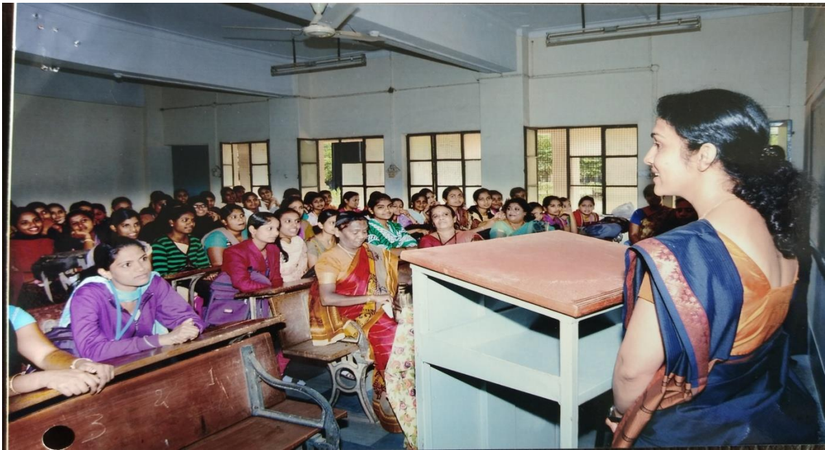
Speech on “Various problems that the youth facing in their competitive world”