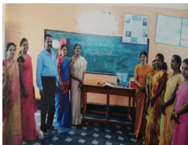
Inauguration of Business Lab