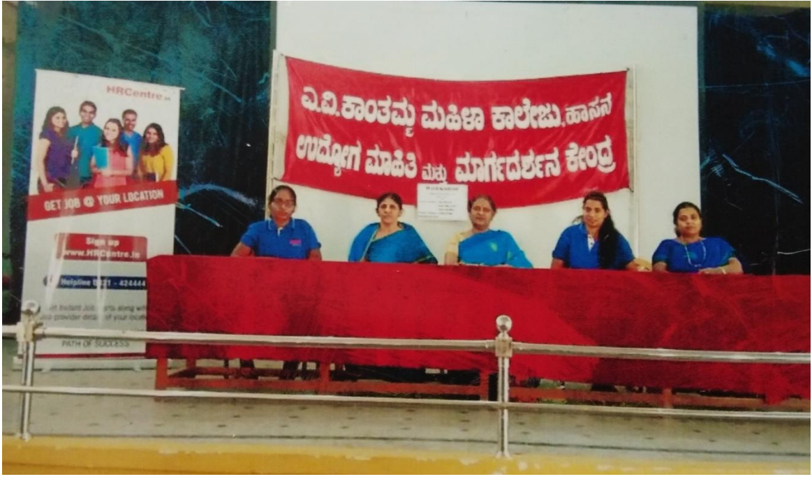
Work shop – “Skill on Wheel” on 06-02-2018