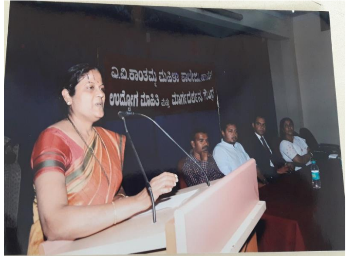
One day Workshop- National Digital Saksharatha Mission