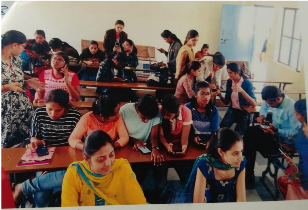
Online test conducted on 09-02-2018 by Hire Me